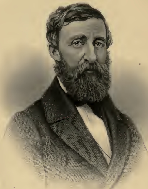
Henry D. Thoreau.